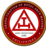
Grand Chapter of Royal Arch Masons of the Philippines